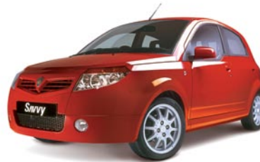
Energy Orange (metallic)