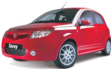
Chilli Red (solid)