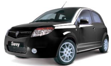
Onyx Black (metallic)