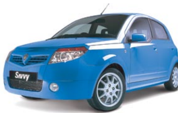
Passion Blue (metallic)