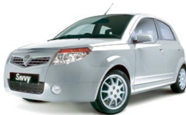
Genetic Silver (metallic)