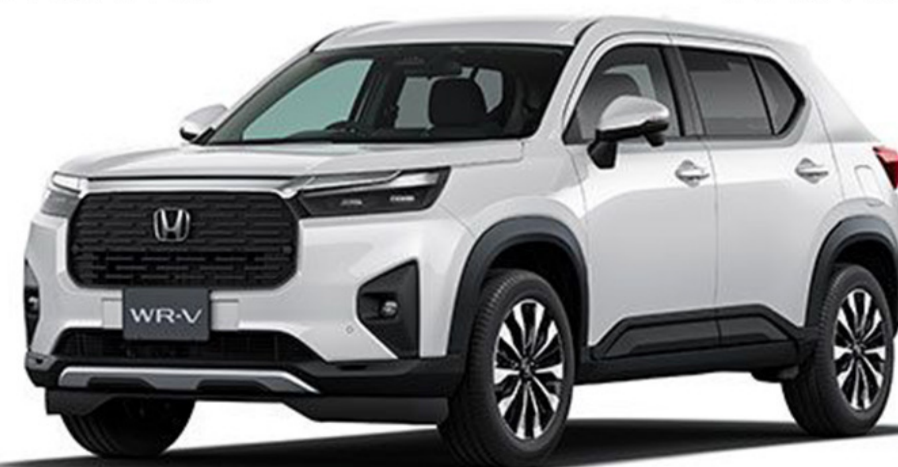
PLATINUM WHITE PEARL*