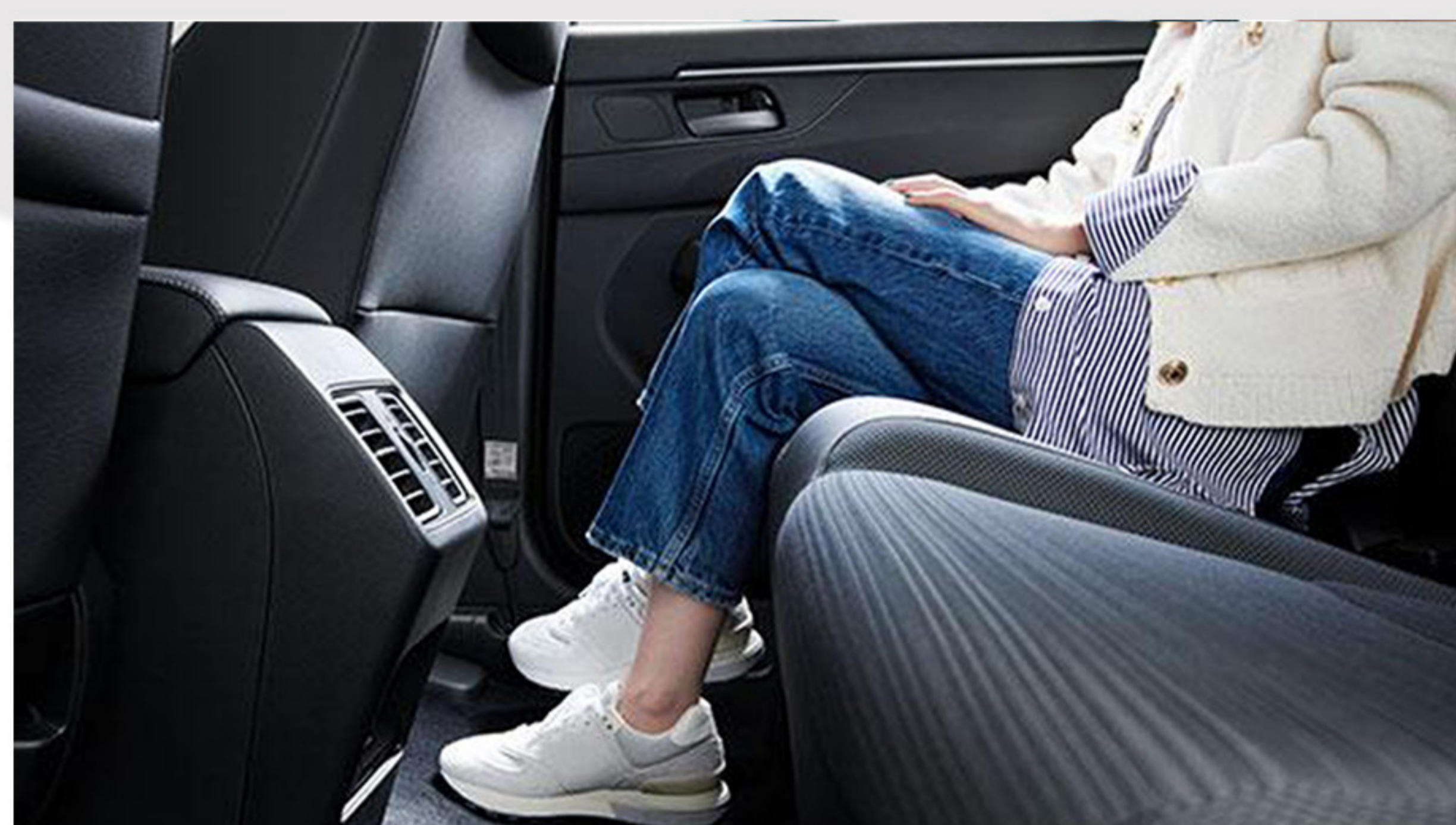
Spacious Leg Room