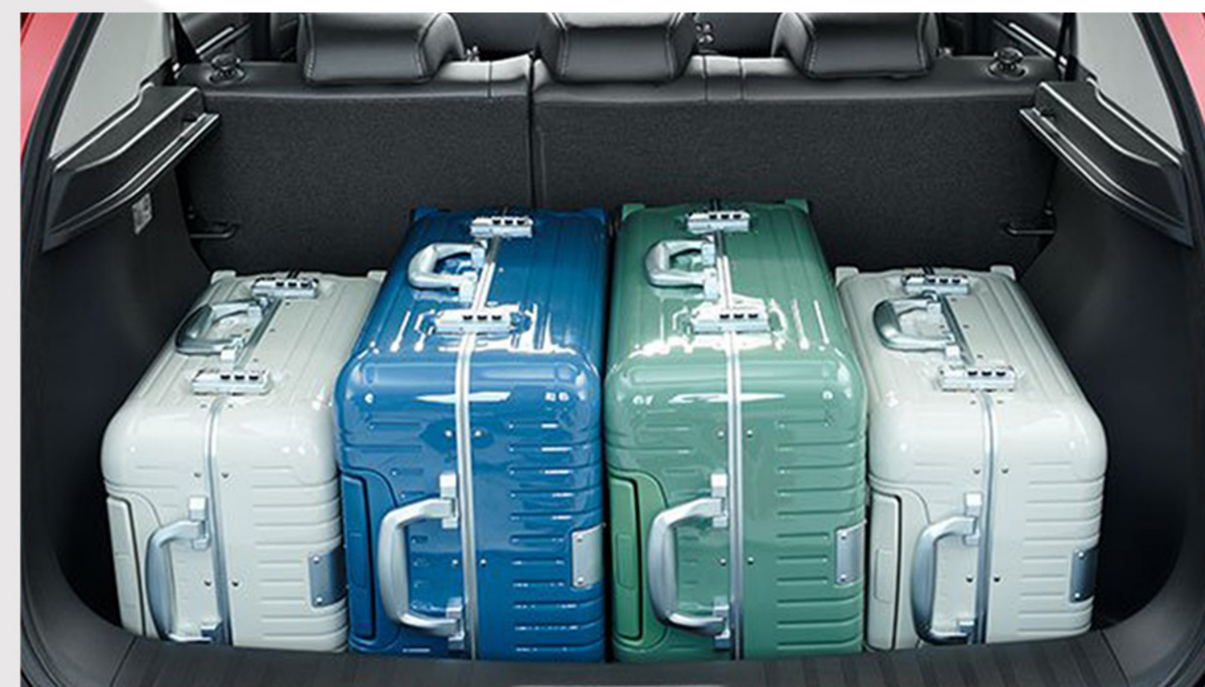
Versatile and Spacious Boot