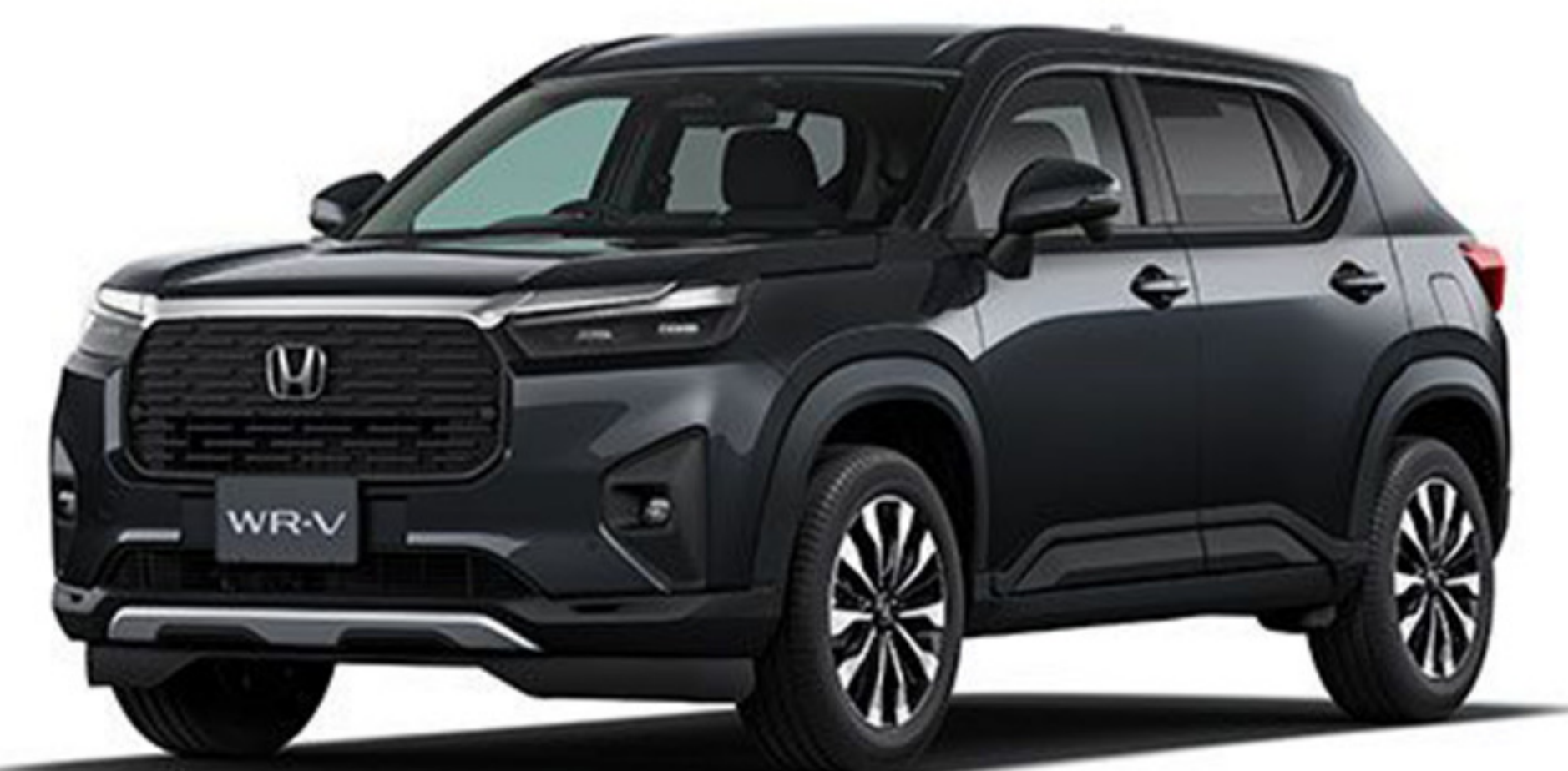
METEOROID GRAY METALLIC*