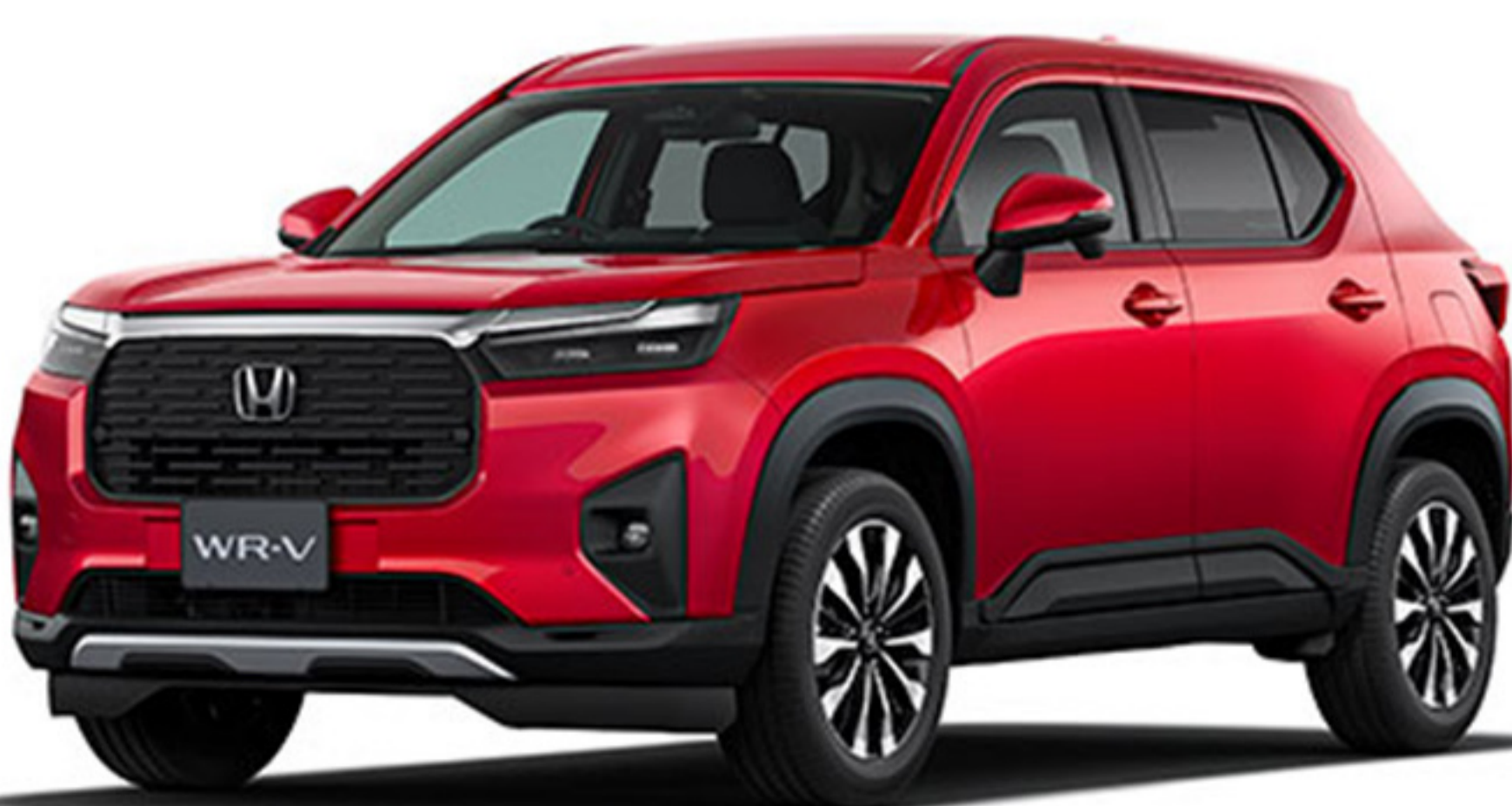
ILLUMINATED RED METALLIC*