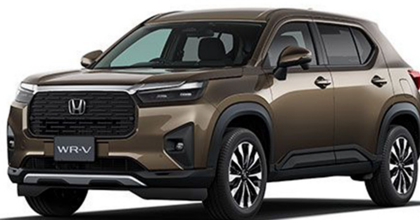
GOLD BROWN METALLIC*