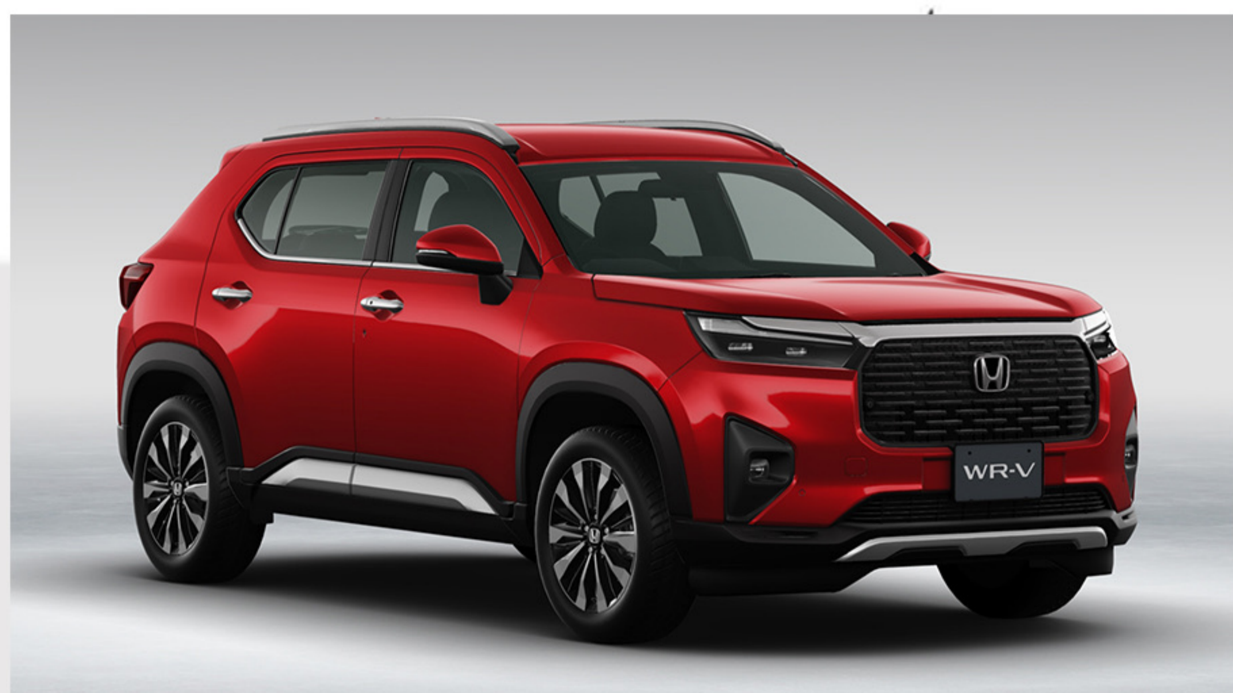
Sporty and Stylish